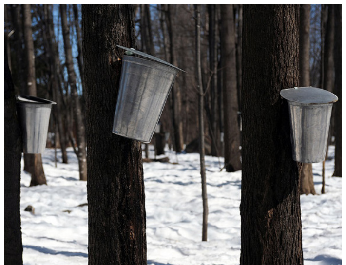
FIGURE 3: Traditional methods of sap extraction, such as these galvanized buckets, are giving way to newer technologies that provide higher yields (5).

According to Burr, even though producers may say they are adopting technology for higher yields, a big reason is to counter the effects of weather.