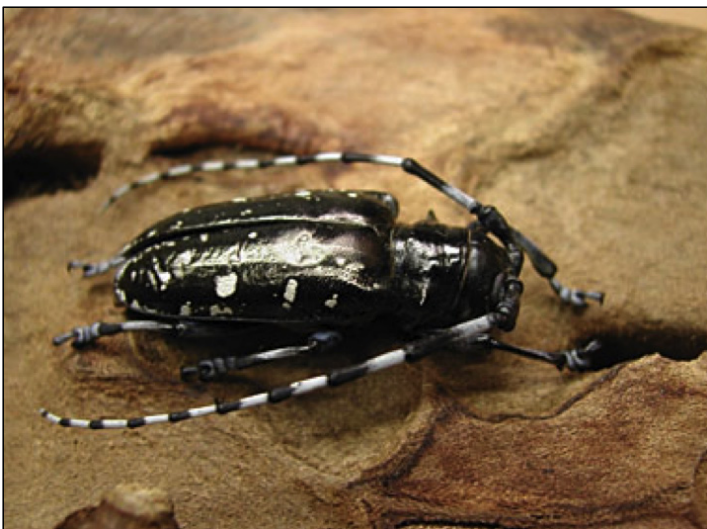
FIGURE 5: The Asian Longhorned Beetle damages and kills Maple trees. maple producers are fearful of its northward expansion (7).

Climate models indicate a decrease in the tapping season by three days. Given that an average season is only 32 days, a 3-day reduction amounts to a 10% decrease (2). A shorter season means less maple, which means less revenue.