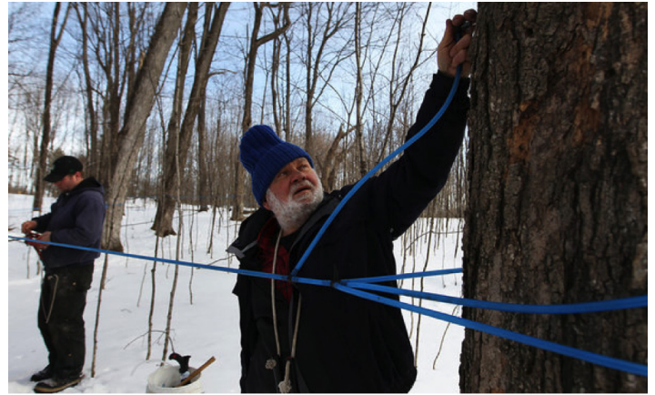
FIGURE 4: Technologies like vacuum pressure tubing allow maple growers to offset impacts from changing weather patterns (6).